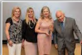
Garden Plaza at Post Falls Community of the Year Winner