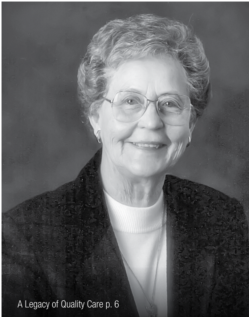
A Legacy of Quality Care p. 6