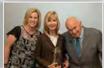
Lake Pointe Landing Chairman's Award