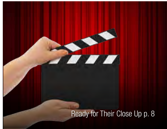
Ready for Their Close Up p. 8