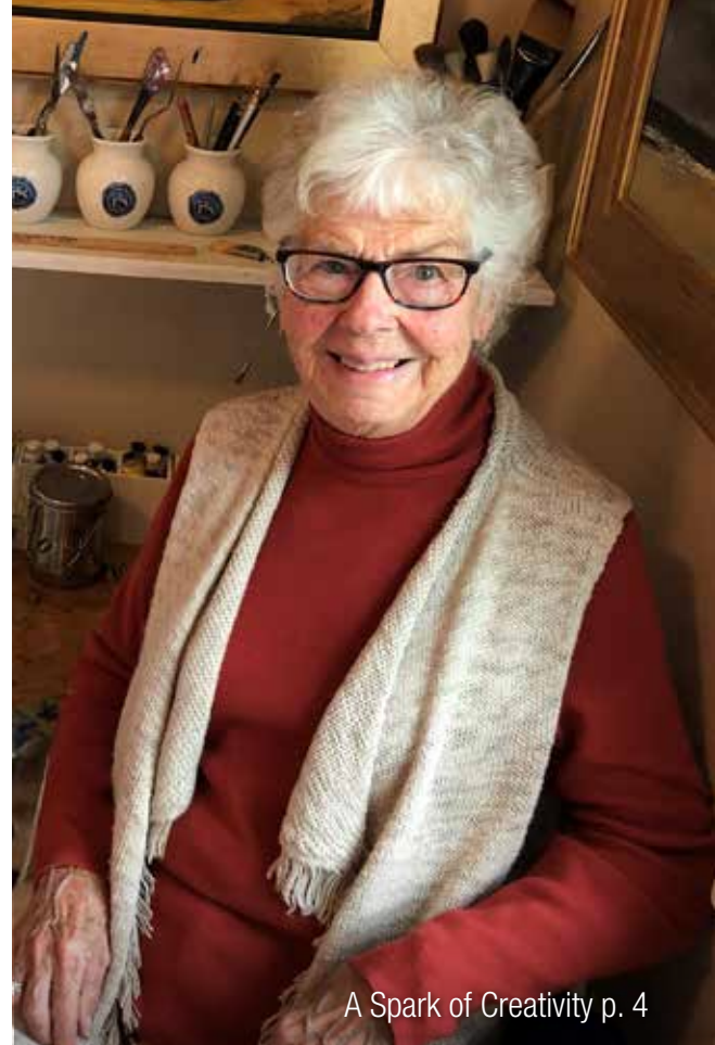
A Spark of Creativity p. 4

9 Balanced Wellness: Life Care Rolls Out the Fit For Life 2019 Contest with Big Changes