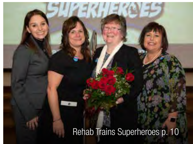
Rehab Trains Superheroes p. 10