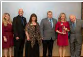
Garden Plaza at Greenbriar Cove Chairman's Award