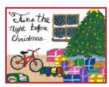
Northeast Division Lisa Elliot (40) Evergreen House Health Center in East Providence, Rhode Island