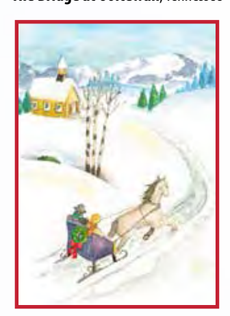
June Hamm (89) The Inn at Garden Plaza in Colorado Springs, Colorado